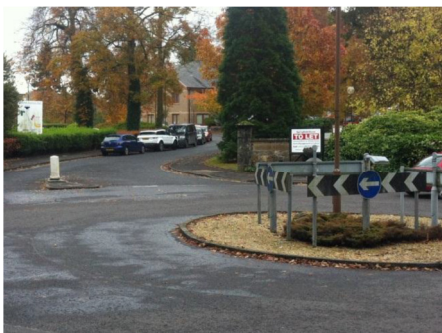
Laurelhill Business Park

From Kings Park Road: Turn left into Laurelhill Business Park at next roundabout Springfield House is at the end of the road